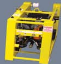
Stationary Hydraulic Power Unit