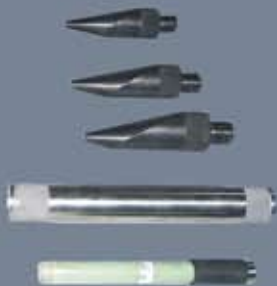
Steering Heads and Sonde