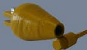
Pull back Expanders and Adapters (Unlimited Variations)