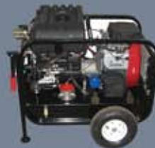
Portable Hydraulic Power Unit