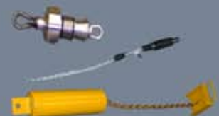
Pipe Grips for Virtually Every Type of Pipe