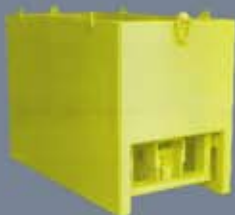
Shoring Push Box (Exceeds OSHA Specifications up to 12' Deep)